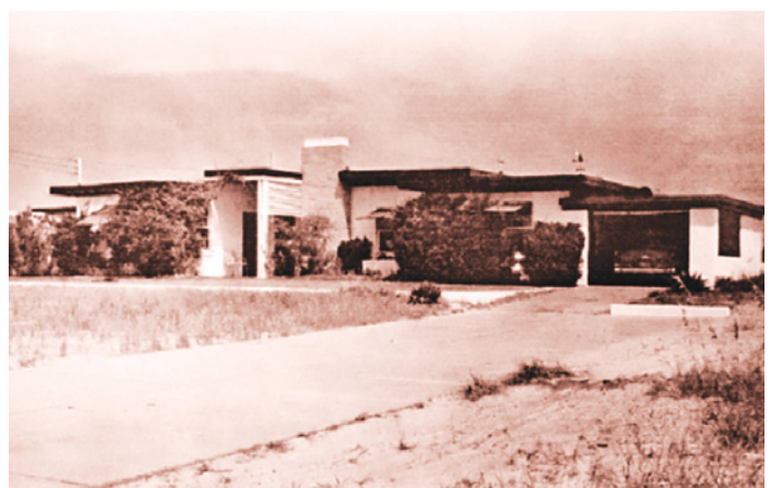
Frank Stick's cottage at 60 Ocean Boulevard

Flat Tops were built throughout the community into the 1960s. Today, fewer than half of the original structures remain.