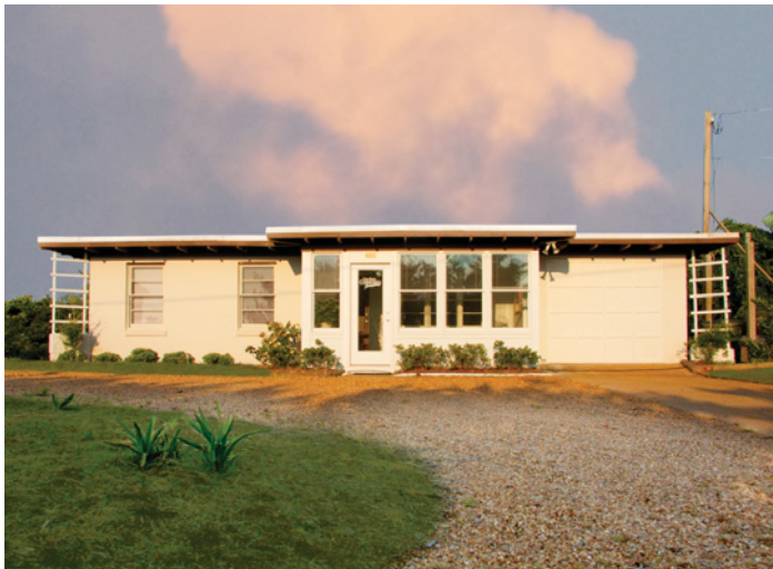
Foundation office at 13 Skyline Road

Believed to be the first Flat Top constructed on the dune overlooking the Atlantic Ocean, 13 Skyline Road was built in 1953.