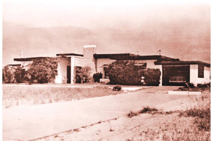
Frank Stick's cottage at 60 Ocean Boulevard

Flat Tops were built throughout the community into the 1960s. Today, fewer than half of the original structures remain.